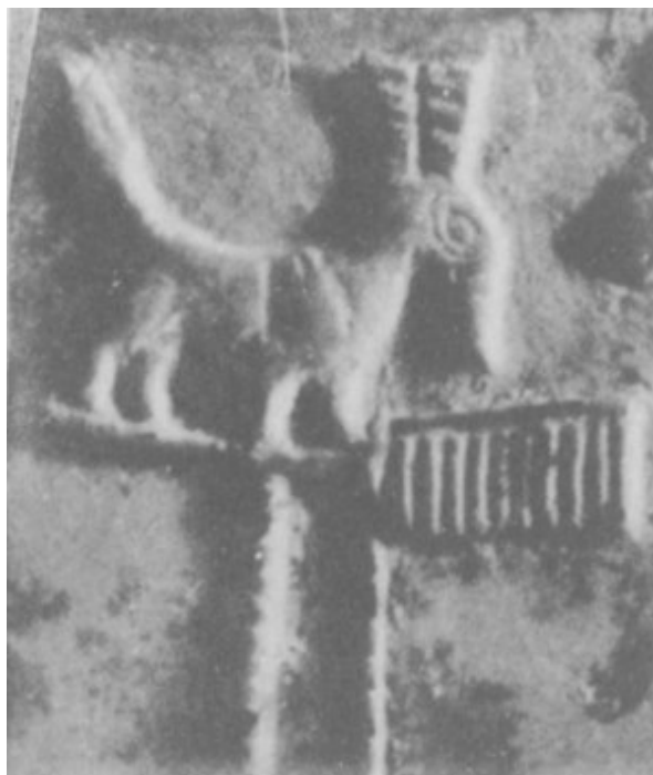
Fig. 1: Seth animal on a standard; mace head of the pre-dynastic king "Scorpion" from the tomb U-j in Abydos (Naqada IIIA1).