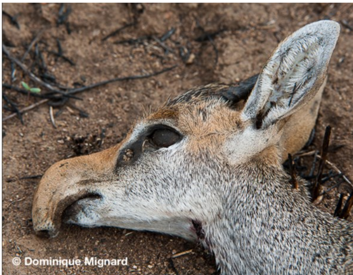
Fig. 4: Adult male Günther's dik-dik found dead (killed by a predator) at Parc national de Mago, Ethiopia. This somewhat sad photo is presented here because it clearly shows the length of the snout (compare to Seth in Fig. 2).

Günther's dik-diks have an interesting feature with regard to our question – an extension of the nose and upper lip into a downwardly curved snout that anatomically corresponds to a short trunk (proboscis). It is particularly long and mobile in males. 21 The length and shape of the trunk, the shape and position of the small nostrils and the contour of the forehead and nasal bone are well comparable to the corresponding details of the Seth animal (Figs. 3 and 4). Both sexes of the Günther's dik-dik have a preorbital gland, with the secretion of which they mark their territory. This gland appears as a black spot that, from a distance, looks as if it belongs to the eye (Fig. 3). This could explain why the front corner of the Seth animal's eye is often noticeably elongated. 22 In addition, the Günther's dik-dik's eyes are framed in white. There is a possible parallel for this in the Seth animal.