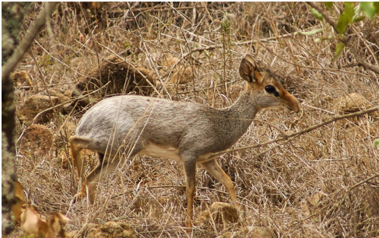
Fig. 3: Adult male Günther's dik-dik at Ol ari Nyiro (Laikipia Nature Conservancy), Kenya.

habitats by the advancing desertification. 20